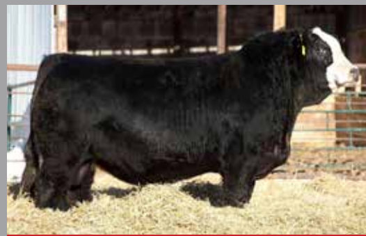
MUIRHEADS TACTIC 69D