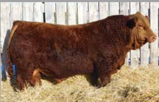
SVS TYCOON 841F