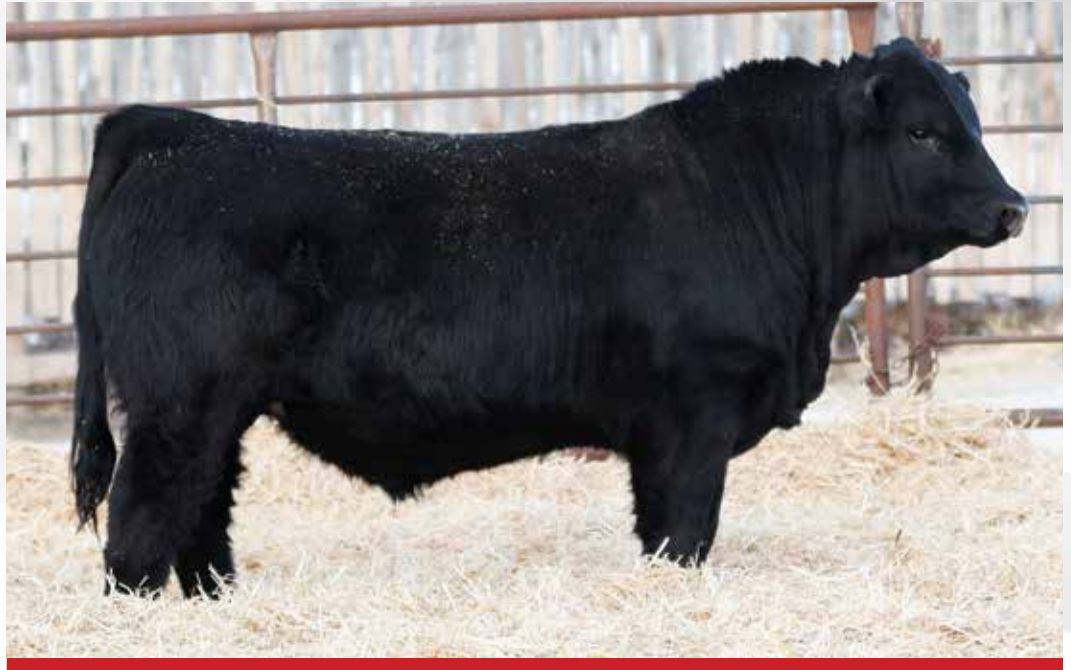
24 DEEG MR CAPACITY 80J #1373678 - RDD 80J - Jan 17, 2021 LOT