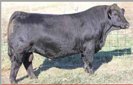
RF CAPACITY 742E