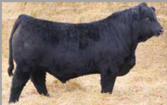
R PLUS 9189G