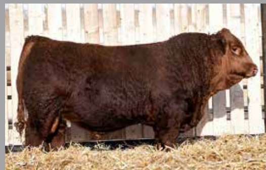
NUG LANDMARK 310G