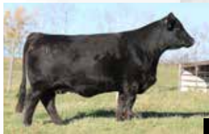
MATERNAL GREAT GRANDDAM