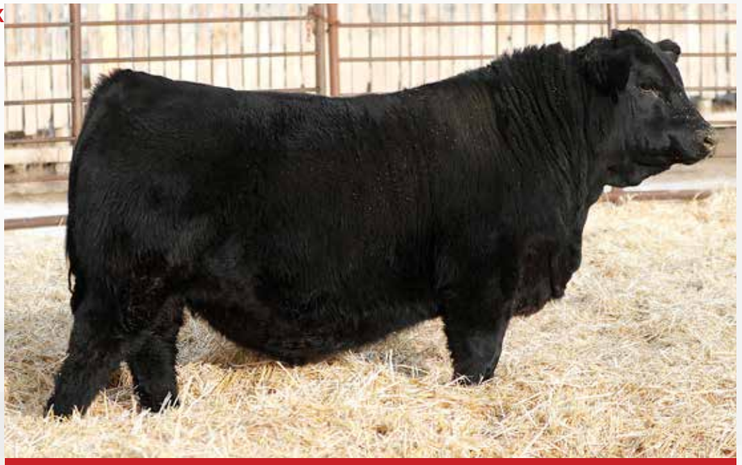
25 DEEG MR CAPACITY 144J #- RDD 144J - Feb 5, 2021 LOT