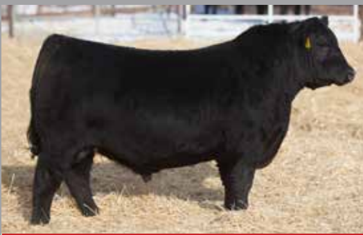
BROOKING GRIMLEY 7105