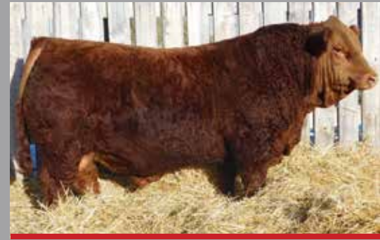
SVS TYCOON 841F