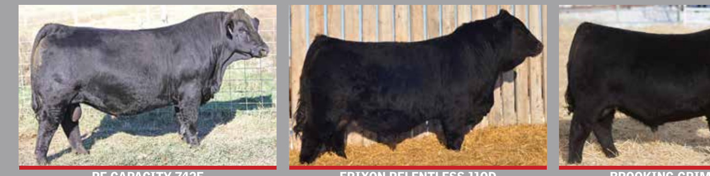
RF CAPACITY 742E