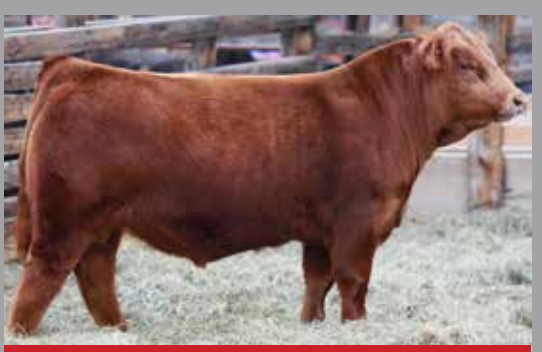
RUST/HENN RAMBLER 6003