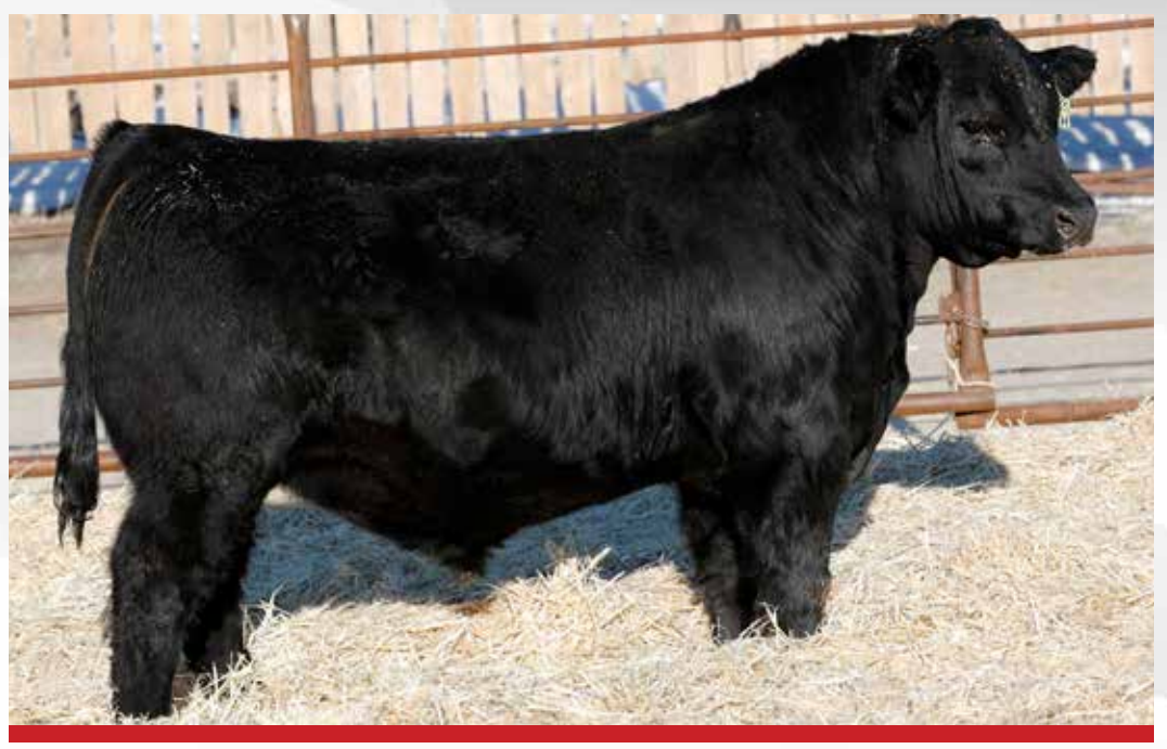
BROOKING BANK NOTE 4040 BROOKING GRIMLEY 7105 BROOKING ANNIE 4037

- Used Grimely the first year to clean up after AI but the calves we received were too good to use him just for a cleanup bull, he had his own group of heifers the second year to give us more of these good halfbloods - Brooking Grimley has an excellent foot structure with lots of heel. He looks great all year round and carries himself extremely good with tons of presence - Bottom side goes back to Maders Iron Sugar donor. Deeg Ms 102F is loaded with maternal power